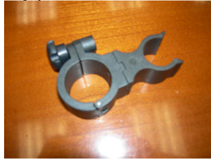
Rotating Two-Hole Clamp