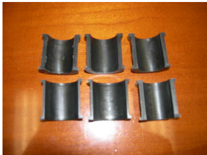
Six (6) Plastic Inserts