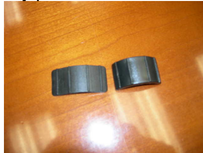
Two (2) Scored Rubber Inserts