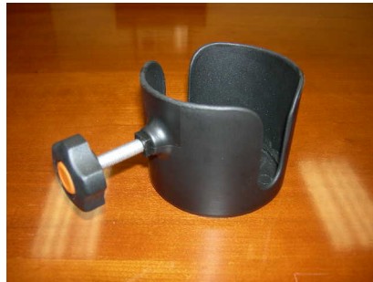
Cup Holder with Star Knob