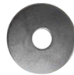
(8) 1¼ in. washers for leveling legs