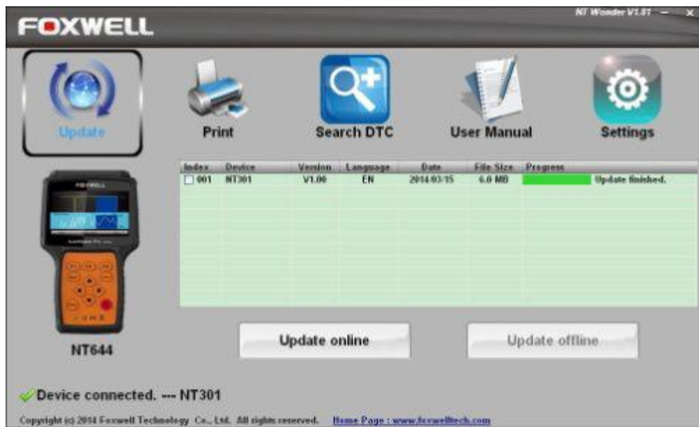
Sample Update Done Screen

8. A Update Finished Message displays when the update is completed.