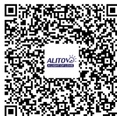
Ask a question