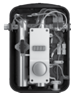
RTEX-08, RTEX-11, RTEX-13