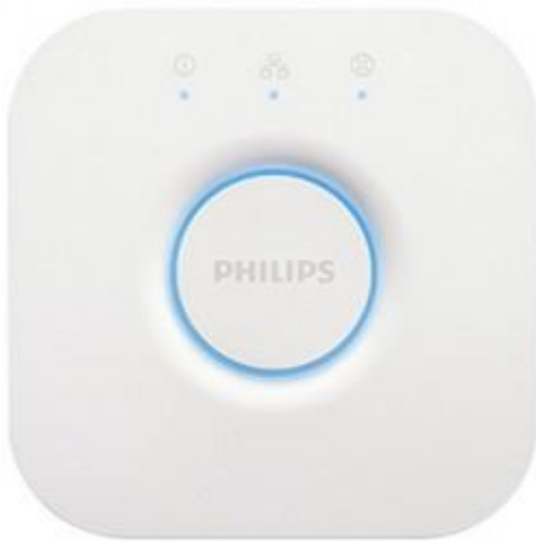
Philips Hue Bridge 2.0 – Apple Home Kit Compatible