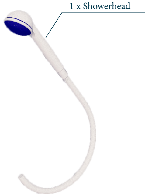
1 x Showerhead