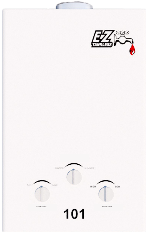
1 x EZ Tankless Water Heater