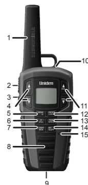
Radio color/pattern varies according to model number.

*Range may vary depending on environmental and/or topographical conditions.