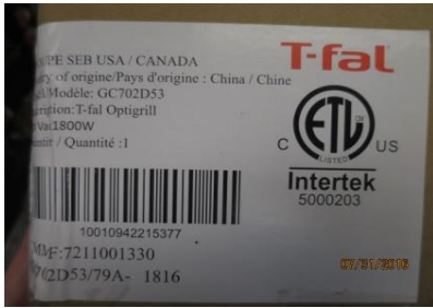
MASTER BOX LABEL