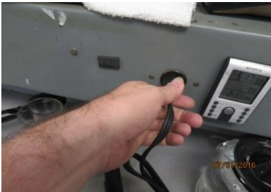
PLUG IN THE OPTIGRILL