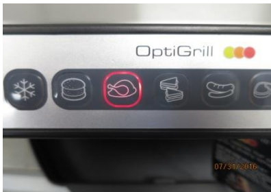
SELECT WHAT IS BEING COOKED