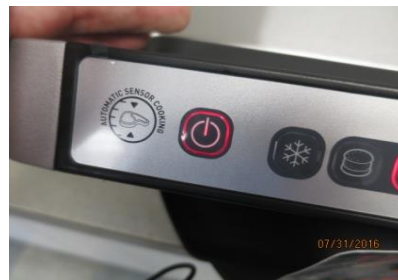
PRESS THE ON BUTTON