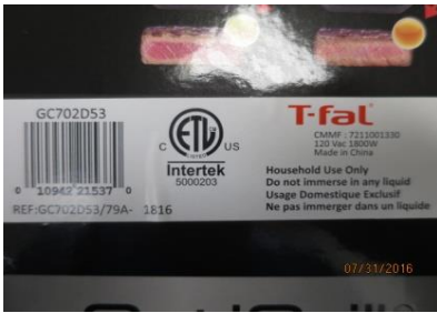
PICTURE BOX LABEL