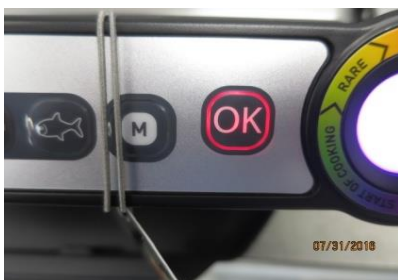
OK BUTTON WILL BRINK PRESS IT TO START THE PREHEAT