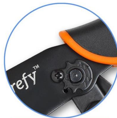
Adjustable compression wheel

If the crimp is too hard (nylon insulation is damaged), or too soft (wire can be easily pulled out of the crimp), you can adjust the crimp height. 1. Remove set screw. 2. Rotating the adjustment wheel counterclockwise increases the crimp force and decreases the crimp height. 3. Rotating the adjustment wheel clockwise decreases the crimp force and increases the crimp height. 4. Reinsert set screw