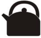
Stainless steel pot