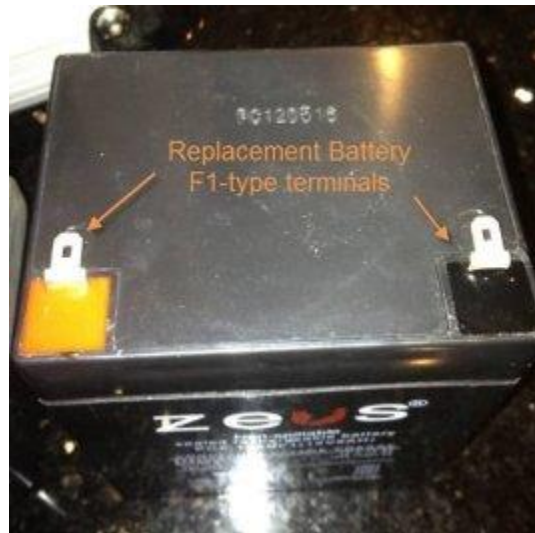
F1 to F2 Step Up Adapter