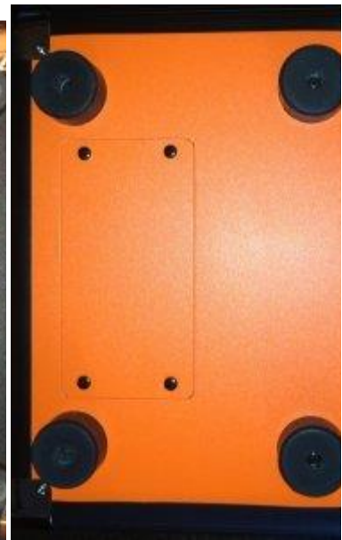
Job Rocker (bottom)

In some cases, such as the Block Party Live, the battery access is on the rear of the unit and the handle must be removed first, as shown in the images below. To remove the handle, simply remove the four screws that fasten it to the unit.