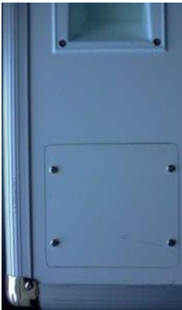
Block Rocker Series (side)