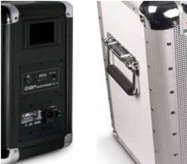
Block Rocker 2010 & Later Block Rocker Pre-2010

To determine when your unit was produced, refer to the images below. Units produced in 2010 or later feature an easy-access battery compartment, which allows for the battery to be replaced by the customer. These 2010 and newer units can be identified by the recessed plastic carry handles on the side of the enclosure. Earlier units featured metal hinged handles.