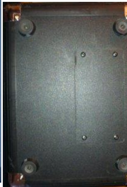
Tailgater Series (bottom)