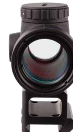
Lower 1/3 Co-Witness Mount