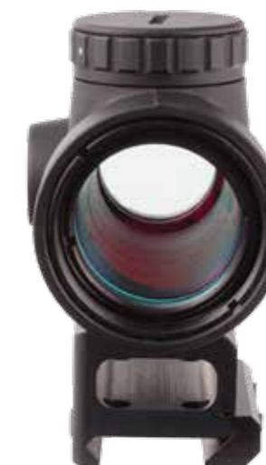
Full Co-Witness Mount