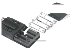
Battery Type Selector

WARNING: Never install alkaline batteries with the Battery Type Selector switch set to NI-MH. Alkaline batteries can get hot or explode if you try to recharge them.