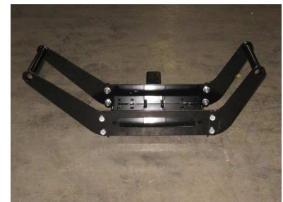
Winch Cradle (#2811)

For Technical Support/Warranty Information please call 310-762-9944