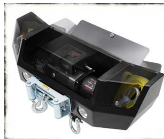
Black Box (#2805)