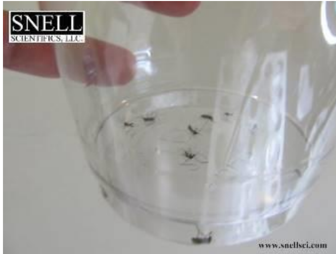
Photograph 5. Test Systems in Post-Treatment after Treatment

Sponsor: Sprinkler Magician Study: Direct Spray 16 Trial: AEDSAE Sponsor Code: N/A Test Method: 311