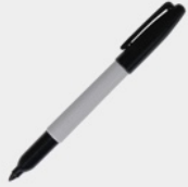
Pen, pencil or fine-tip marker