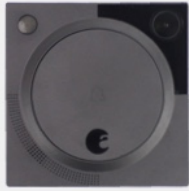
August Doorbell Cam