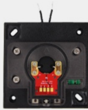
Doorbell Cam spacer, mounting plate and wiring