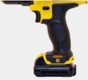
Drill w/ drill bit set