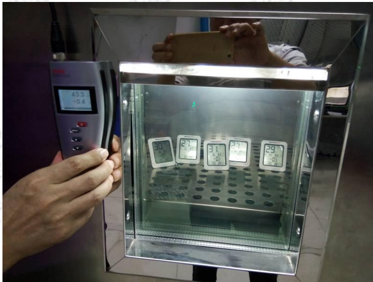
Fig. 5 Test Picture