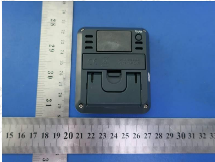
Fig. 3 Product Picture