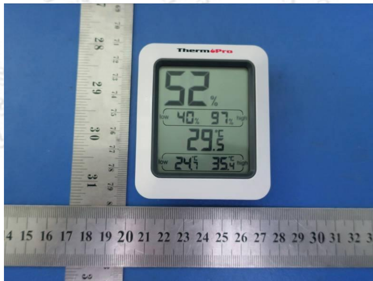
Fig. 2 Product Picture