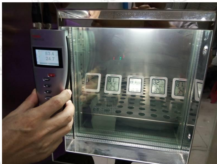
Fig. 10 Test Picture