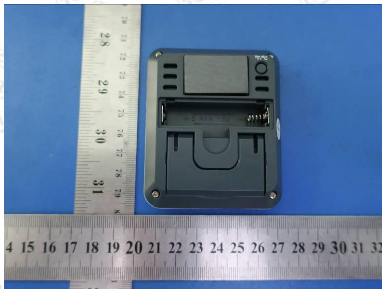
Fig. 4 Product Picture