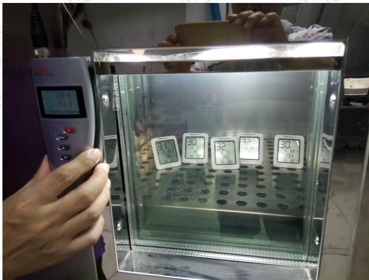
Fig. 6 Test Picture