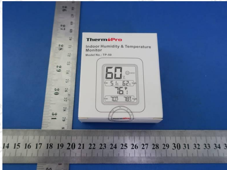
Fig. 1 Product Picture