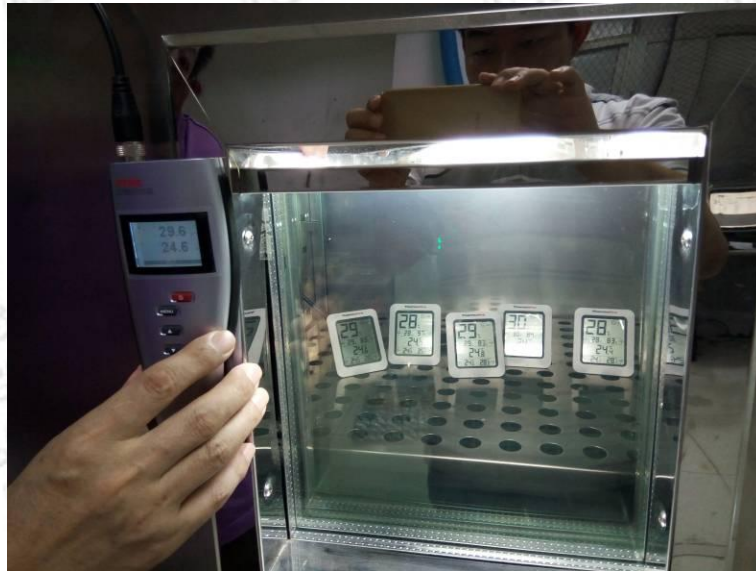
Fig. 7 Test Picture