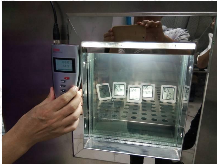
Fig. 9 Test Picture