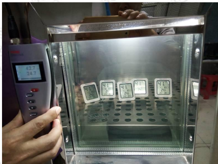
Fig. 8 Test Picture