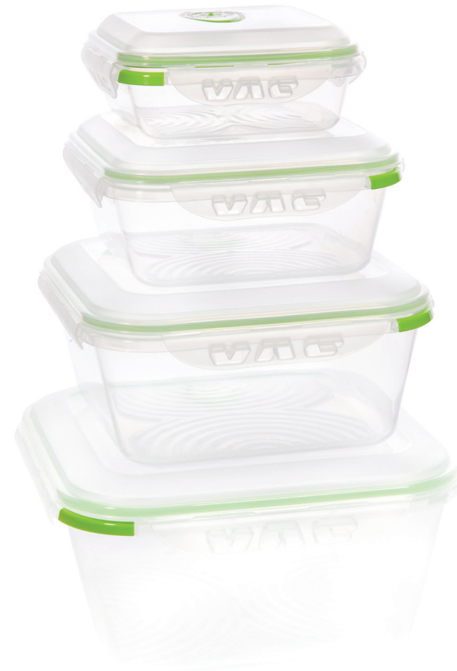
Model# FS1: User Guide