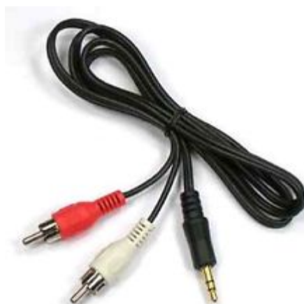
Left & Right RCA Plug to 3.5mm Stereo Plug