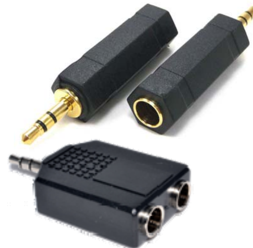
1/4" Mono Phono Plug to 3.5mm Stereo Plug