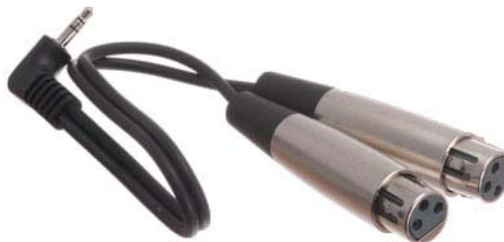
Left & Right XLR Plug to 3.5mm Stereo Plug