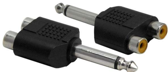
Left & Right RCA Plug to 1/4" Mono Phono Plug