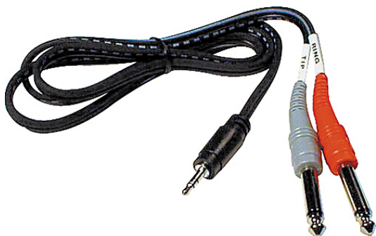
Left & Right 1/4" Mono Phono Plug to 3.5mm Stereo Plug