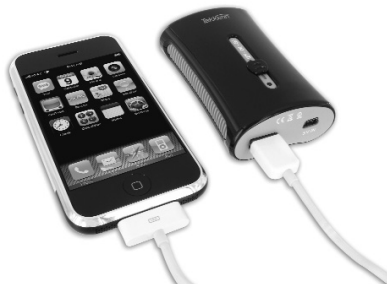
Charging a device using its USB cable.

NOTE: You can use the emergency flashlight while charging your device.