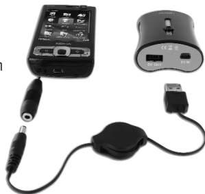
Charging a device using its USB cable.

NOTE: If none of the included adapters fits snugly into your portable device power jack, please go to our web site at www.tekkeon.com/mp1800adapters to determine which adapter plug you need for your device. You can obtain most adapters through the web site, or by contacting Tekkeon by phone at: 1-888-787-5888 or 1-714-832-1266 . If available through Tekkeon, the adapter will be sent to you for a nominal fee.