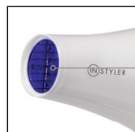
Tourmaline Ceramic Grill Evenly distributes heat and emits negative ions to reduce frizz