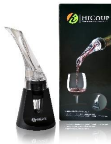
Red Wine Aerating Pourer