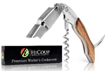
Rosewood Waiter's Corkscrew