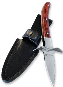
Oyster Knife with Sheath