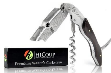
Ebony Wood Waiter's Corkscrew