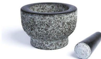
Granite Mortar & Pestle