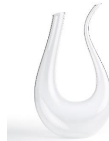
Crystal Glass Wine Decanter