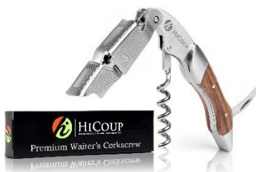
Stainless Steel with Rosewood Inlay Waiter's Corkscrew