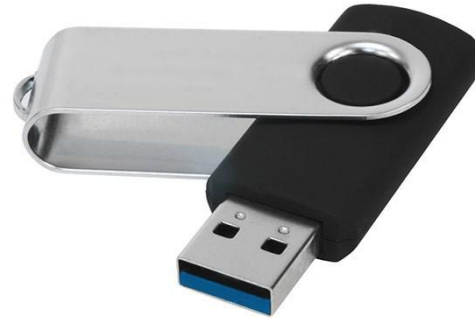
USB flash drive