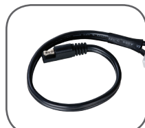
SAE solar plug adapter