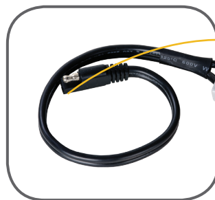
SAE solar plug adapter