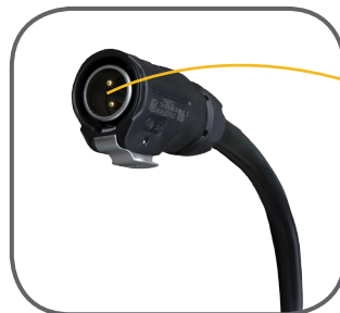
XLR-style solar plug