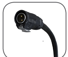
XLR-style solar plug