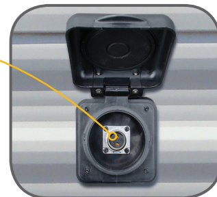
Connects to XLR-style solar ports, such as the Furrion solar port.