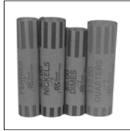
Coin Wrapper Starter Pack