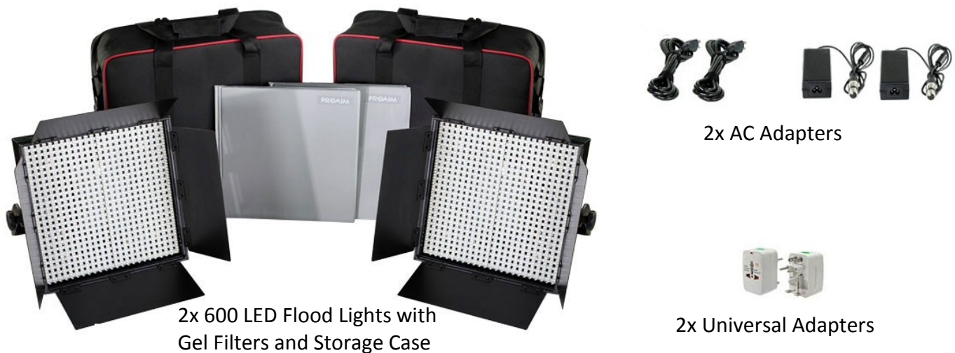
2x 600 LED Flood Lights with Gel Filters and Storage Case

Please inspect the contents of your shipped package to ensure you have received all that is pictured and listed below.