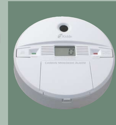
Carbon Monoxide Alarms