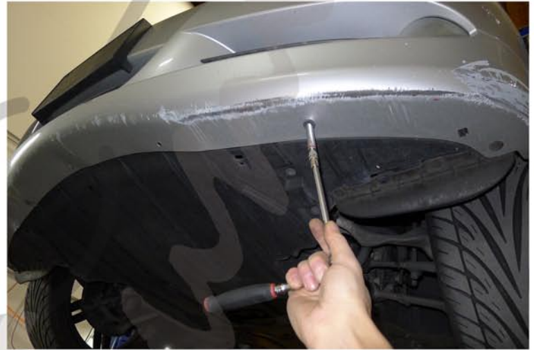
2. Remove the (7) 8mm screws