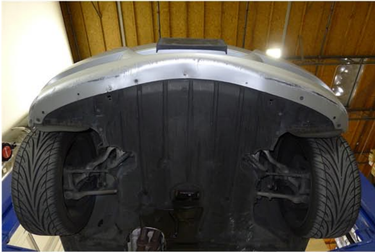
1. (7) 8mm screws location

Do not make direct contact with the halogen bulbs or the wire assembly until the unit has cooled down after use.