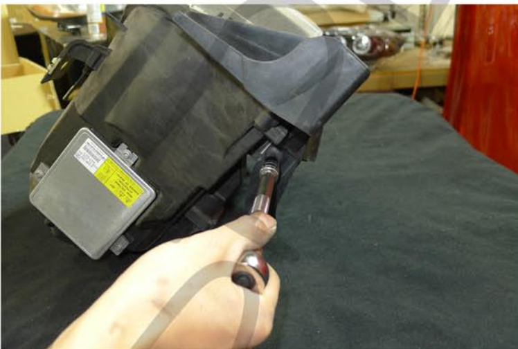
21. Remove the T30 bolt