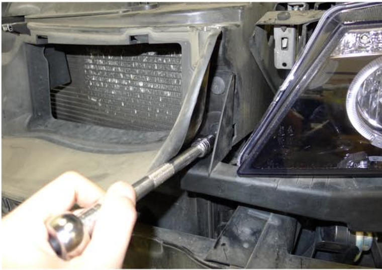
29. Tighten the (2) T30 bolts