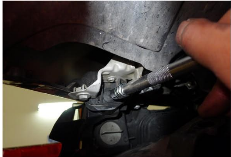
18. Remove the T30 bolt