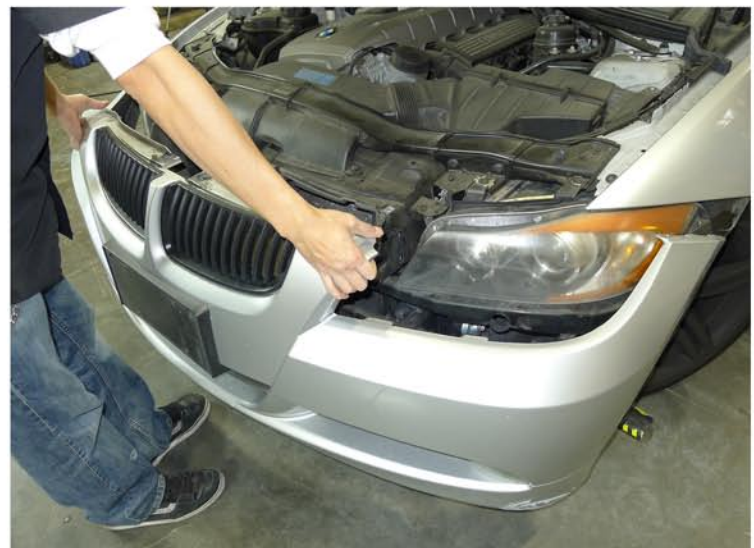
10. Remove the front bumper