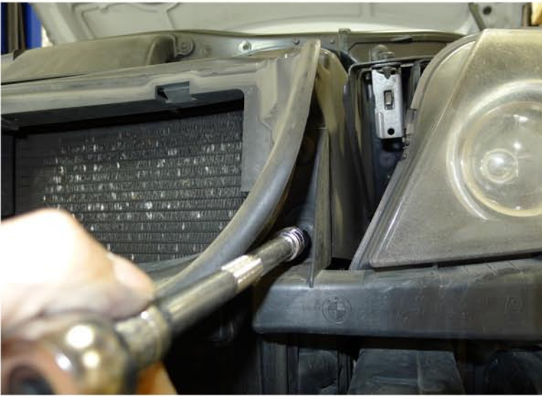
17. Remove the (2) T30 bolts