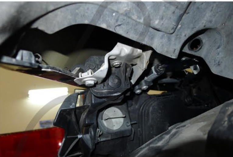
17. Pull the fender liner aside