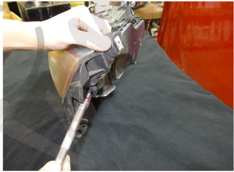
20. Remove the T30 bolt