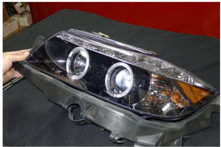
22. Position the headlight bracket on the new headlight