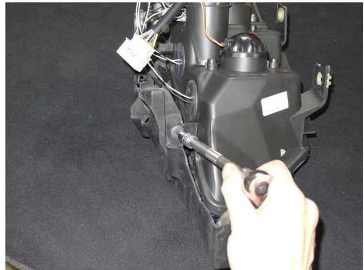
24. Tighten the T30 bolt