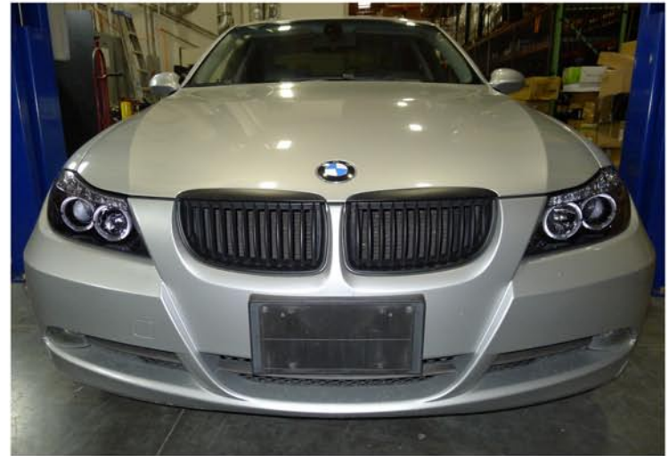
40. The installation is now complete