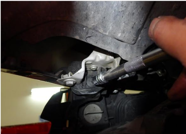
31. Tighten the T30 bolt