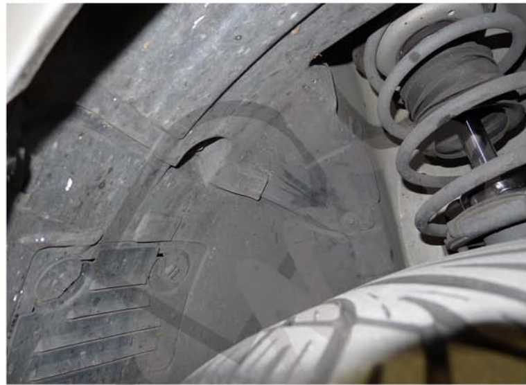
12. (2) 8mm screws location