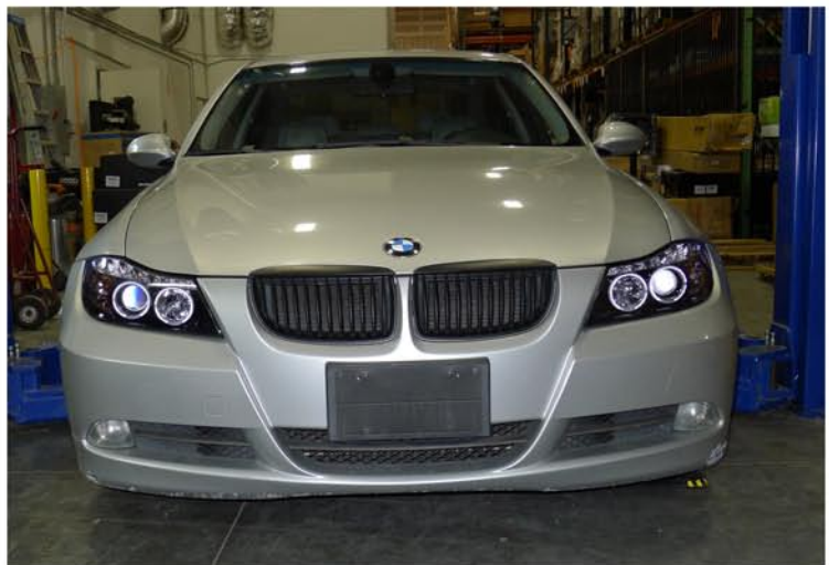
39. Please repeat the steps in order from 1 to 38 for the opposite side