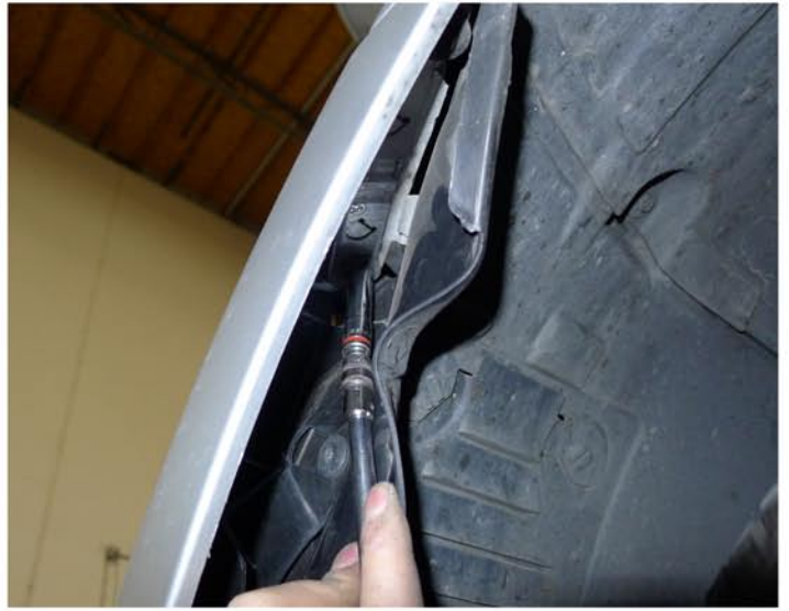
36. Tighten the (2) 8mm screws