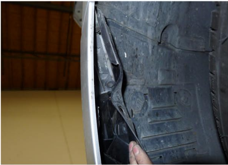
5. Pull the fender liner aside