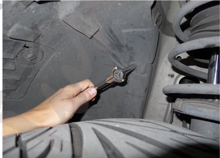
14. Remove the (2) 8mm screws