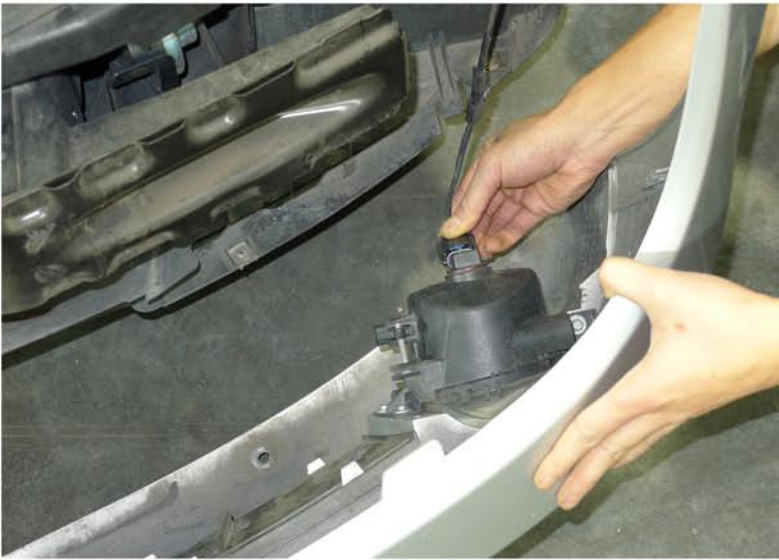
11. Disconnect the fog light harness