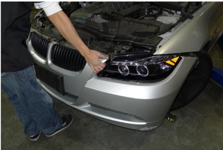
33. Replace the front bumper