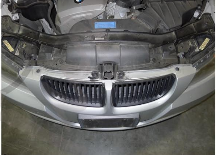
8. (4) T30 bolts location