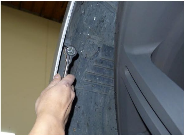
37. Tighten the (2) 8mm screws