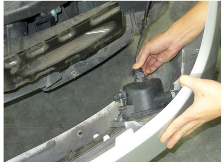
32. Connect the foglight harness