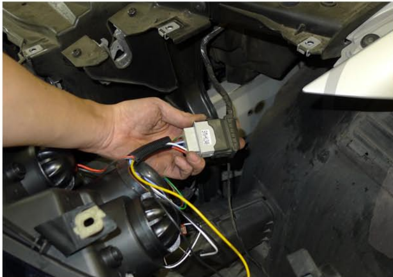
25. Connect the headlight harness to the new headlight Please see the Halo and L.E.D installation instructions If your headlights don't have HALO or L.E.D. You can skip it