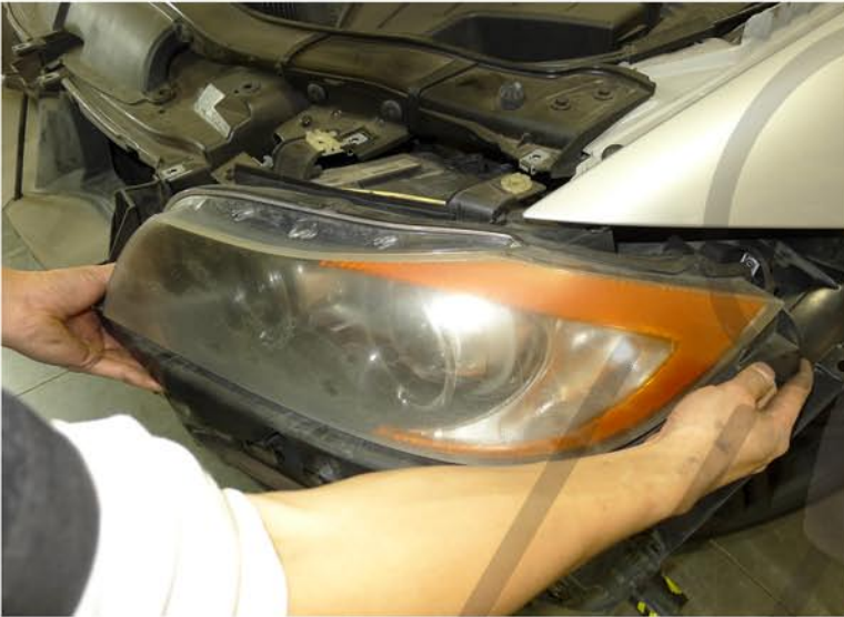
19 Remove the headlight assembly