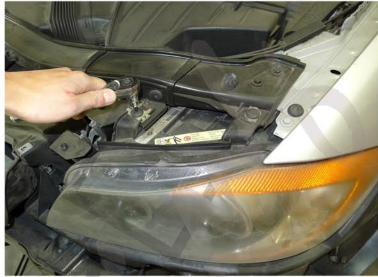
18. Remove the (2) T30 bolts