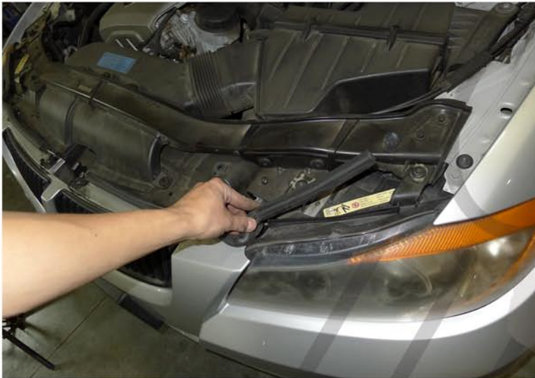
7. Remove the weather strip