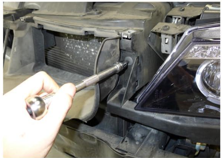
30. Tighten the (2) T30 bolts