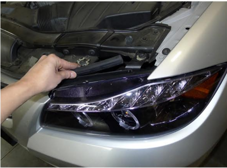
35. Replace the weather strip