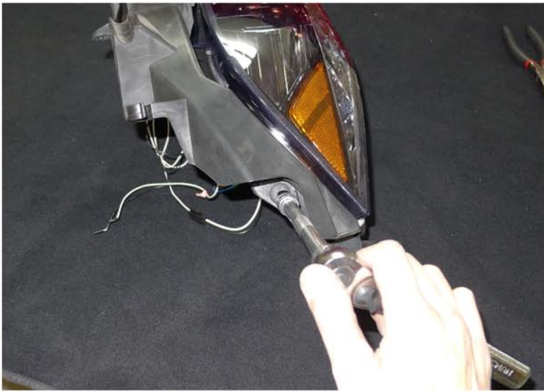
23. Tighten the T30 bolt