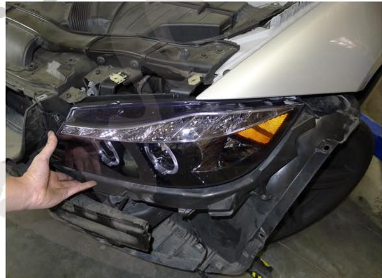
26. Place the new headlight in the stock location