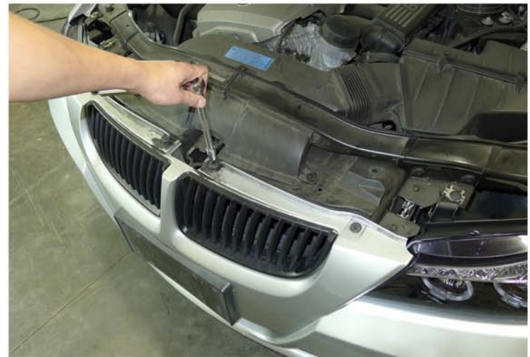
34. Tighten the (4) T30 bolts