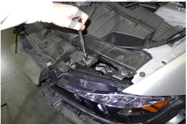
27. Tighten the (2) T30 bolts