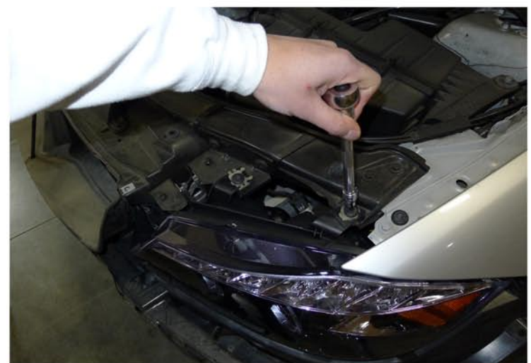
28. Tighten the (2) T30 bolts