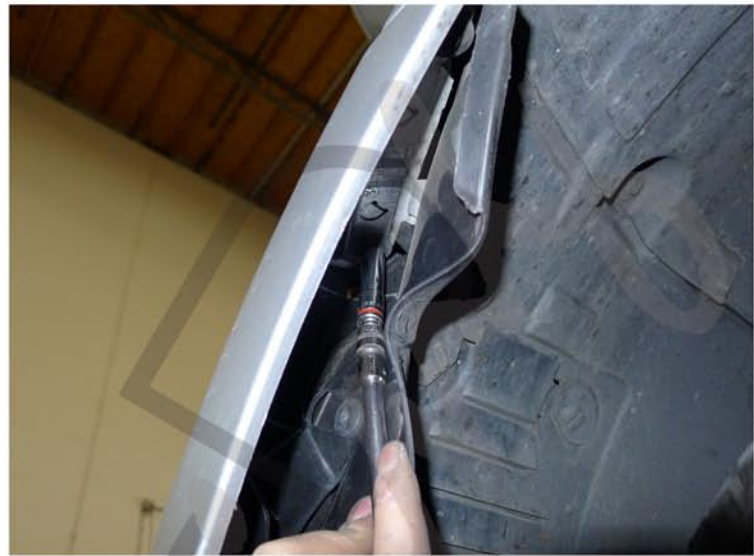
6. Remove the (2) 8mm screws