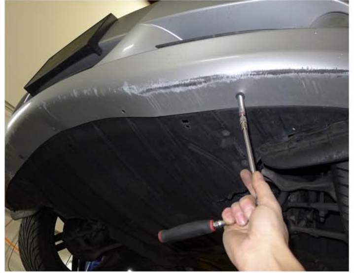
38. Tighten the (3) 10mm bolts