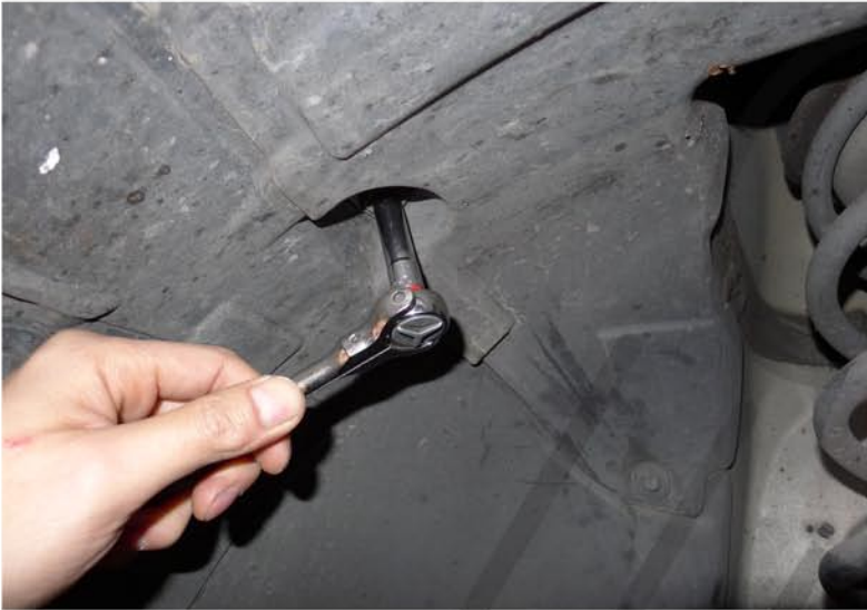
13. Remove the (2) 8mm screws