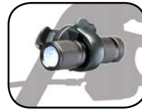
• Item # FL-1000