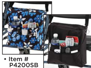
• Item # P4200SB (Aloha Blue)