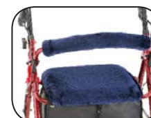
• Item # 4007BM (Blue Midnight)