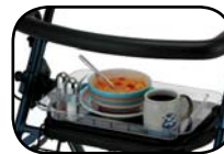
• Item # 4000T