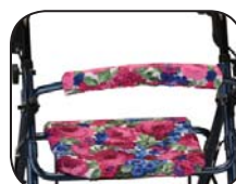
• Item # 4007EG (English Garden)