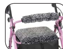
• Item # 4007SL (Snow Leopard)