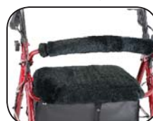
• Item # 4007BP (Black Puma)