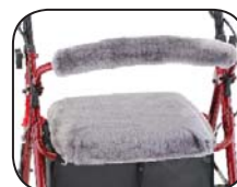
• Item # 4007GD (Grey Dusk)