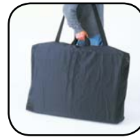
• Item # 4000TB