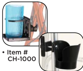
• Item # CH-1000