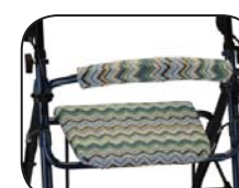
• Item # 4007BH (Blue Hues)