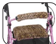
• Item # 4007SC (Safari Cheetah)

• Add glam, add style, add luxurious feel. Make it all about you. Stand out from the crowd and make a statement!