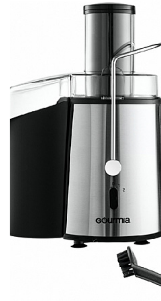
Gourmia Wide Mouth Fruit and Vegetable Juice Extractor