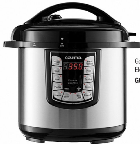
Gourmia 8 Quart Smart Pot Electric Pressure Cooker GCP800

Why not Add these Best-selling Gourmia Appliances to your Kitchen!