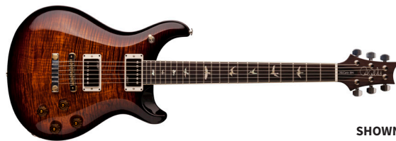
SHOWN IN Black Gold Wrap Burst