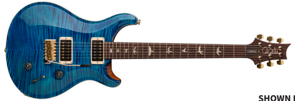
SHOWN IN Aquamarine