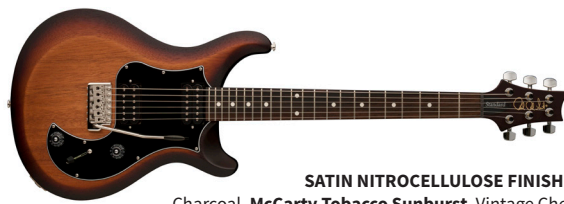
SATIN NITROCELLULOSE FINISHES: Charcoal, McCarty Tobacco Sunburst , Vintage Cherry