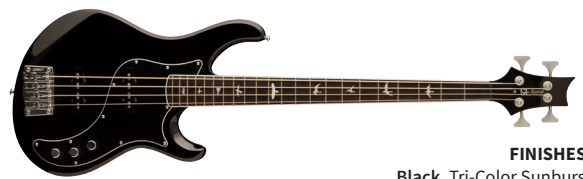
FINISHES: Black, Tri-Color Sunburst