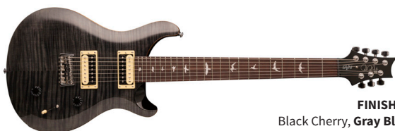
FINISHES: Black Cherry, Gray Black