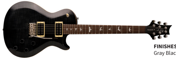
FINISHES: Gray Black