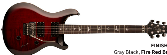
FINISHES: Gray Black, Fire Red Burst