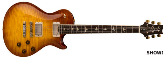
SHOWN IN McCarty Sunburst