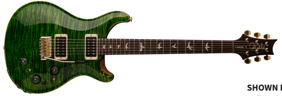
SHOWN IN Emerald