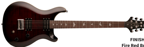
FINISHES: Fire Red Burst