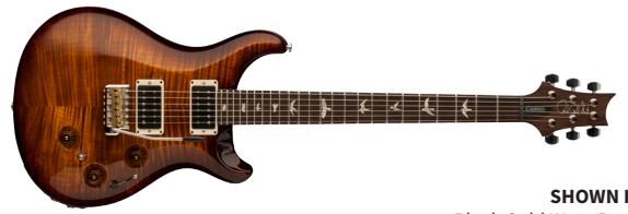
SHOWN IN Black Gold Wrap Burst