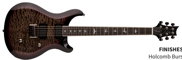
FINISHES: Holcomb Burst