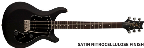
SATIN NITROCELLULOSE FINISHES: Charcoal, McCarty Tobacco Sunburst , Vintage Cherry