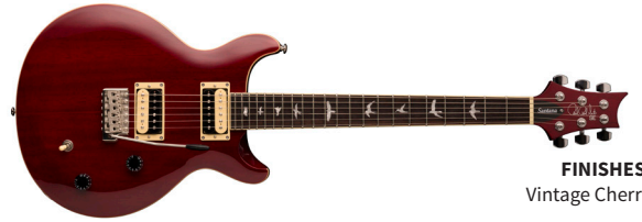
FINISHES: Vintage Cherry