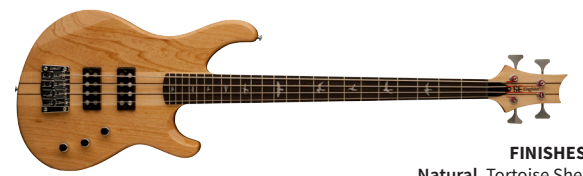
FINISHES: Natural, Tortoise Shell