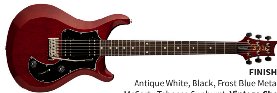
FINISHES: Antique White, Black, Frost Blue Metallic, McCarty Tobacco Sunburst , Vintage Cherry