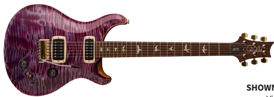
SHOWN IN Violet