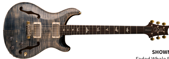
SHOWN IN Faded Whale Blue