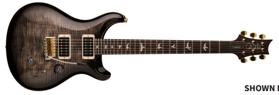
SHOWN IN Charcoal Burst