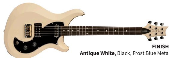
FINISHES: Antique White, Black, Frost Blue Metallic, McCarty Tobacco Sunburst , Vintage Cherry