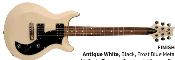
FINISHES: Antique White, Black, Frost Blue Metallic, McCarty Tobacco Sunburst , Vintage Cherry