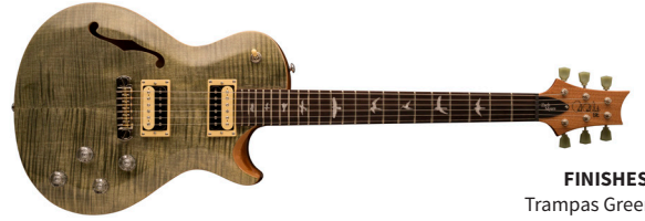
FINISHES: Trampas Green