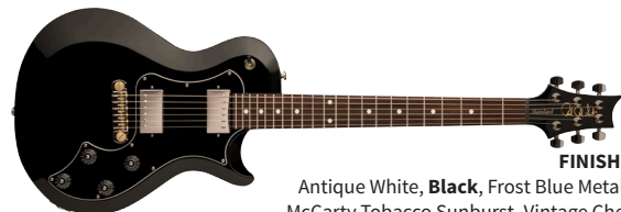
FINISHES: Antique White, Black , Frost Blue Metallic, McCarty Tobacco Sunburst , Vintage Cherry