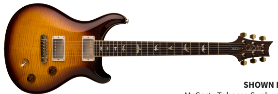
SHOWN IN McCarty Tobacco Sunburst