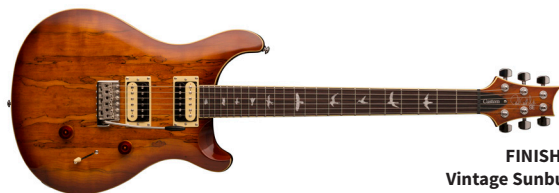
FINISHES: Vintage Sunburst