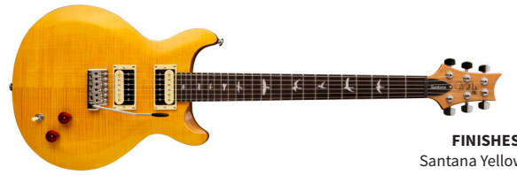
FINISHES: Santana Yellow