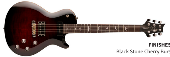
FINISHES: Black Stone Cherry Burst