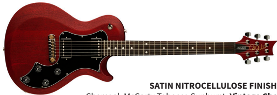
SATIN NITROCELLULOSE FINISHES: Charcoal, McCarty Tobacco Sunburst , Vintage Cherry