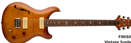
FINISHES: Vintage Sunburst