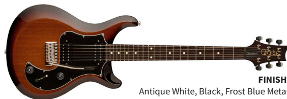
FINISHES: Antique White, Black, Frost Blue Metallic, McCarty Tobacco Sunburst , Vintage Cherry