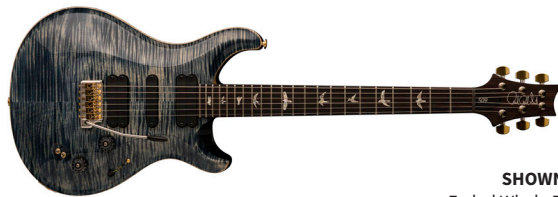
SHOWN IN Faded Whale Blue