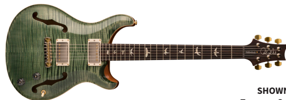
SHOWN IN Trampas Green