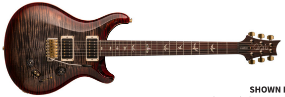
SHOWN IN Charcoal Cherry Burst